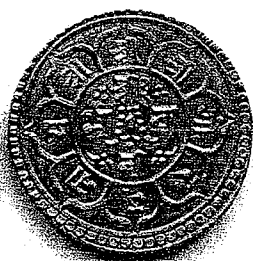
Fig. 2 reverse

Obv: Śrī/ Śrī Śrī Sure/ndra Vi/krama/ Sāha Deva/ 1794. Rev: Same die as last. Diam: 26mm Wt: 23.00 g