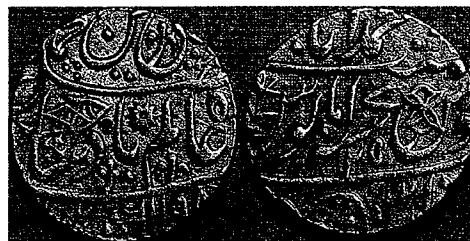
Fig. 4 Banaras rupee, AH 1198, RY 17/25, 11.31 gm, 24 mm

It seems to me there are two possible explanations for the circle mark and its brief life. One possibility is that the Company decided to change the dārogā for the issue, but ended up unsatisfied with his performance and re-employed the dārogā of the leaf sprig. The other is suggested by the fact that, as Pridmore notes, the mintage of AH 1195 was particularly large. There were over 2.2 million rupees minted at Banaras that year, as compared to just under 670,000 in AH 1194 and just over 250,000 in AH 1196. The dārogā of the leaf sprig may not have been able to handle the large demand, and so the Company could have diversified their sources by retaining the dārogā of the circle. Original documents in London might be able to resolve this issue.