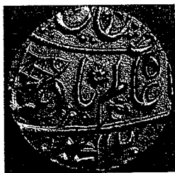
New daroga mark Fig. 6

Finally, coin 4 is yet another Banaras rupee, AH 1200, RY 17/27, that fills a gap in Pridmore's listing of the dārogā marks on the coins of this series. Specifically, for AH 1200, RY 17/27, Pridmore has a question mark in the column of illustrations of the dārogā marks. Perhaps he did not have access to a coin which was clear enough for the marks to be seen clearly. Coin 4 here shows the dārogā marks clearly, and, in particular, indicates the appearance of a new mark (see fig. 6) in place of the leaf sprig. The new mark consisted of a central pellet, surrounded by four curved pellets. Pridmore's table (and my own observation) shows that the leaf sprig reappeared in RY 28, so the 5-pellet mark was another short-lived one, like the circle mark of RY 23.