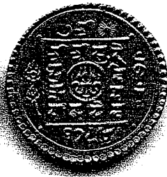
Fig. 2 obverse

Obv: Śrī Śrī Śrī Trailokya Vi/ra Vi/krama/ Sāha Deva/ 1796. Rev: Śrī 3/ Bhavā/nī in central circle, Śrī Śrī Śrī Gorakhanātha in petals around. Diam: 26mm Wt: 23.05 g