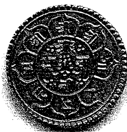
Fig. 1 reverse

Obv: Śrī Śrī Śrī Trailokya Vi/ra Vi/krama/ Sāha Deva/ 1796. Rev: Śrī 3/ Bhavā/nī in central circle, Śrī Śrī Śrī Gorakhanātha in petals around. Diam: 26mm Wt: 23.05 g