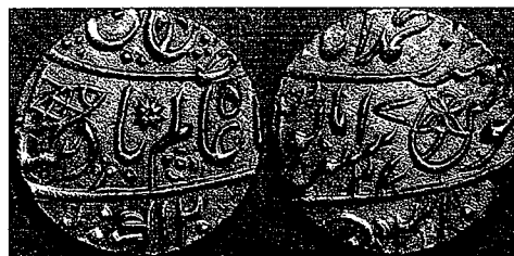
Fig. 5 Banaras rupee, AH 1200, RY 17/27, 11.17 gm, 24 mm