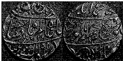
Fig. 2 Banaras rupee, AH 1195, RY 17/23 11.27 gm, 24 mm, with leaf sprig mark

The first coin (fig. 1) is a Murshidabad rupee in the name of Shah Alam II, carrying a crescent mintmark. The unusual aspect of this coin is that the AH date on it is 1185, while the regnal year is 11! Since the regnal year 11 of Shah Alam II spanned AH 1183-84 (coins with RY 11 are known for both these AH dates ... see Pridmore 109-110), this coin must be a mule where an old reverse carrying the RY 11 date was used along with a current AH 1185 obverse.