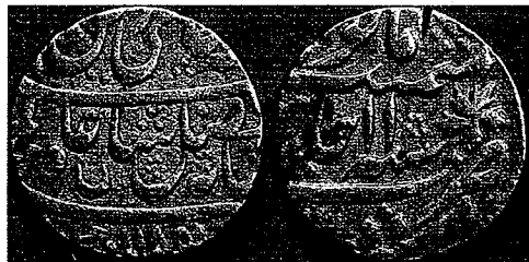
Fig. 1 Murshidabad rupee, AH 1185, RY 11, 11.53 gm, 23 mm