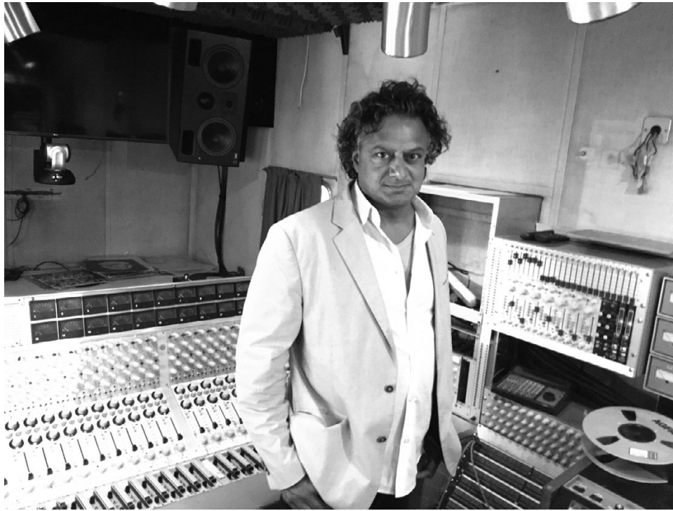
Figure 4.2 Author in front of the 24-track Helios console inside the Rolling Stones Mobile studio, 2016. National Music Centre, Calgary, Alberta.

performances by many of the most popular and emerging British rock and pop acts of the day – the Who, Jethro Tull, the “Dirty Mac” supergroup with John Lennon, Eric Clapton, Keith Richards, and Mitch Mitchell, along with appearances by Marianne Faithfull and Yoko Ono – interspersed with conventional acrobatic routines by authentic circus acts (funambulists, fire breathers, lion tamers, etc.). Intentionally or not, the Stones project here the idea of the rock concert as a circus, its performers likened to trained acts to play before audiences seeking their own vicarious thrills, living perilously on the edge of success and failure, and marginalized – as Richards recounts from the 1964 tour – as a circus act.