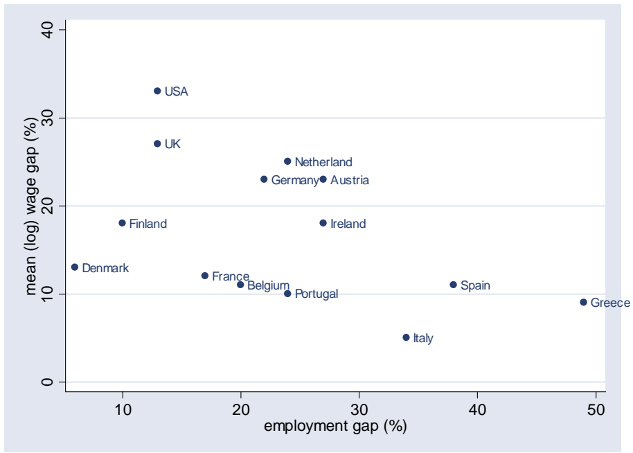
FIGURE 1 Gender gaps across OECD countries, 1999 (Coefficient of correlation: -0.474*)