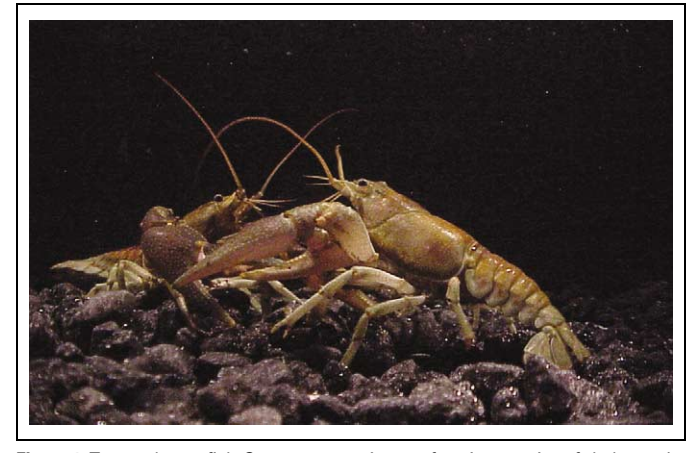
Figure 1. Two male crayfish Orconectes rusticus performing a series of chelae grabs trying to turn each other on to their backs.

fighting fish Betta splendens approach a winner more warily than they do a loser after viewing contests between neighbours [20]; rainbow trout Oncorhynchus mykiss settle a conflict faster with opponents whose fighting performance they had previously watched [21]. In the cichlid fish Oreochromis mossambicus , androgen levels increase in males while they are watching contests [22]. It has been suggested that androgens are the likely mediators of winner and loser effects that act by modulation of the cognitive mechanisms underlying animal communication [22].