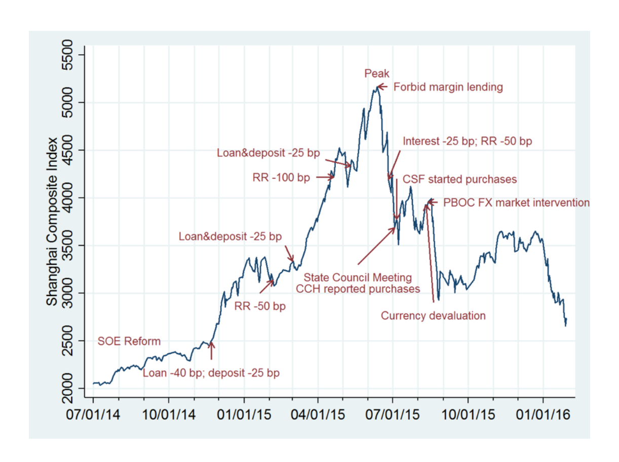
Figure 1: A Chronology of China's Stock Market