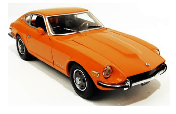
Brand new again to celebrate the 25th anniversary

One of the most creative limited editions ever was how Nissan celebrated the 25th anniversary of the <u>240Z</u>. They chose to offer for sale a handful of the originals fully restored by the factory. What an undertaking! They looked perfect in every detail, right down to a reproduction of the original factory window sticker. The cars were priced at more than $20,000, up from the original price of $3,526 that a 1970 240Z fetched. Should we gather up vintage ThinkPad 700c's and refurbish them to their former glory? Not sure I want to go that far back in time, or that anyone would pay a premium for such an offering.