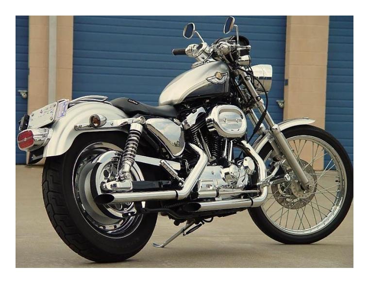
100th anniversary Harley XL1200 Custom celebrated it's heritage with an even more retro design