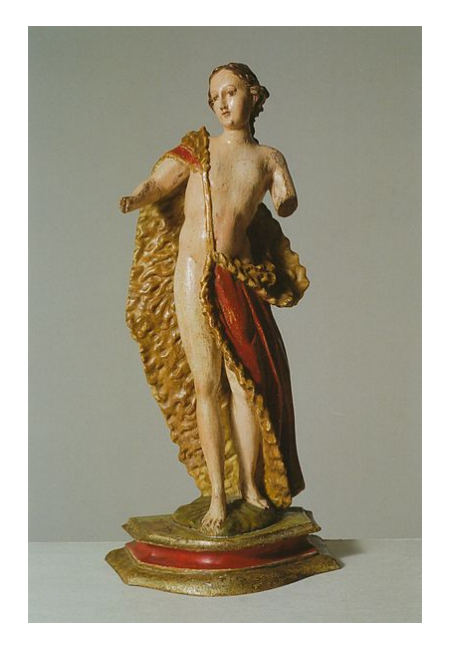
What would a ThinkPad figurine look like?

The names of some anniversaries provide guidance for appropriate or traditional gifts for the spouses to give each other; if there is a party these can be brought by the guests or influence the theme or decoration. These gifts vary in different countries, but some years have well-established connections now common to most nations: 5th Wooden, 10th Tin, 15th Crystal, 20th China, 25th Silver, 30th Pearl, 40th Ruby, 50th Golden, 60th Diamond. The tradition may have originated in medieval Germany where, if a married couple lived to celebrate the 25th anniversary of their wedding, the wife was presented by her friends and neighbors with a silver wreath to congratulate them for the good fortune that had prolonged the lives of the couple for so many years. On celebration of the 50th, the wife received a wreath of gold. Over time the number of symbols expanded and the German tradition came to assign gifts that had direct connections with each stage of married life.