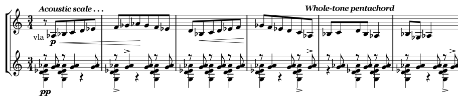
Fig. 3. The subject of Bartók’s “Allegro Pizzicato”

Table 3 shows the DFT magnitudes for these two collections. Remarkably, the largest component of the accompaniment ( \hat{a}_2 ) is a singularity for the acoustic scale, while the largest component for the acoustic scale ( \hat{a}_6 ) is a singularity for the accompaniment. The acoustic scale also has a relatively high value on component 5 while \{\text{DEbGAb}\} has a relatively low value (contrary to what subset relations suggest – the (0156) tetrachord is a subset of the diatonic, but contains precisely the most marginal members of the diatonic on the circle of fifths). Note also that this accompanimental collection is the same set class as B from the Webern analysis above, and can be expressed as a product of dyads, \text{ic1} \times \text{ic5} .