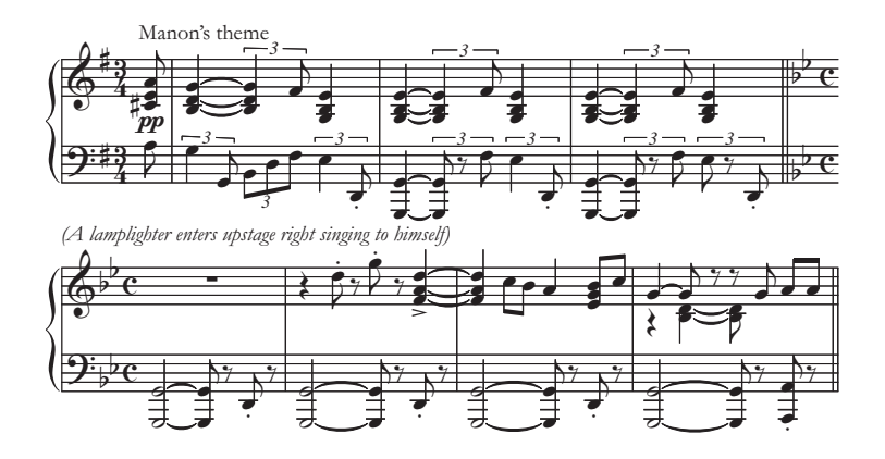
Ex. 3: Manon Lescaut, 111/10/5, "dissolve"

44 A major and F major share the common-tone of A, and could be related in Neo-Riemannian theory by the L transformation of F major to A minor followed by the P transformation of A minor to A major. Nevertheless, the isolated F initially sounds like a conspicuous 'wrong' note, particularly since the common-tone A is not heard simultaneously.