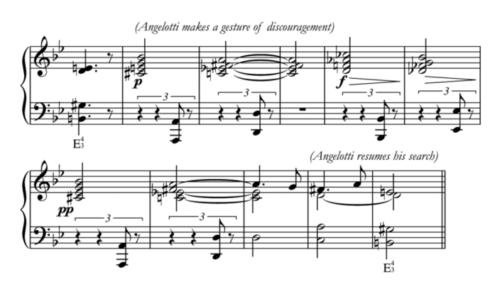
Ex. 1: Tosca , 1/4/o, "close-up"

'Closeup/Cutaway – a shot of some detail, or landscape, that is used break up a matching action sequence. An early example of a close-up is from Grandma 's Reading Glass by George Albert Smith (1900). In Tosca (1900), Act 1/4/0,<sup>43</sup> Angelotti has been searching for the chapel key, but after an E dominant 4/3 chord on which the accompanying theme comes to rest, he makes a 'gesture of discouragement' set to its own music, followed by the first theme continuing on from the same E dominant 4/3. [Ex. 1]