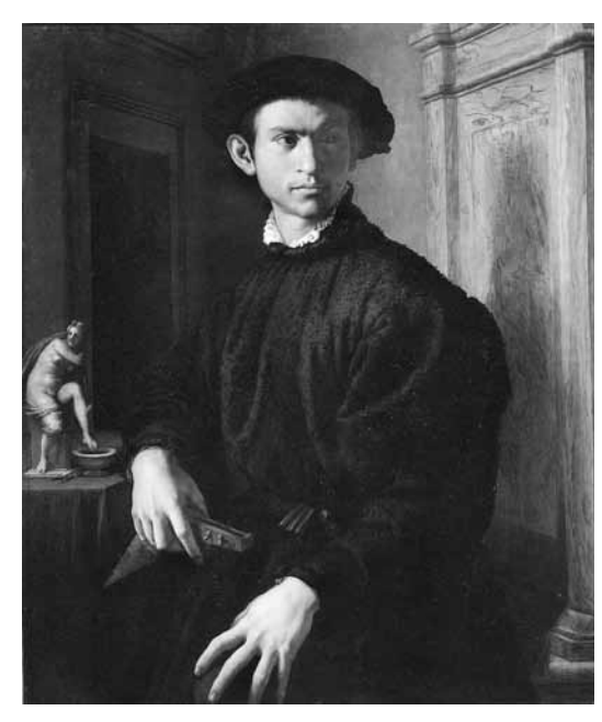
1. AGNOLO BRONZINO, Young Man with a Lute, 1532–34, oil on wood, 94×79 cm. Galleria degli Uffizi, Florence, no. 1575.