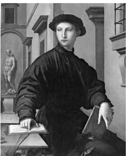
2. AGNOLO BRONZINO, Portrait of Ugolino Martelli, ca. 1535, oil on wood, 102×85 cm. Gemäldegalerie, Staatliche Museen, Berlin.