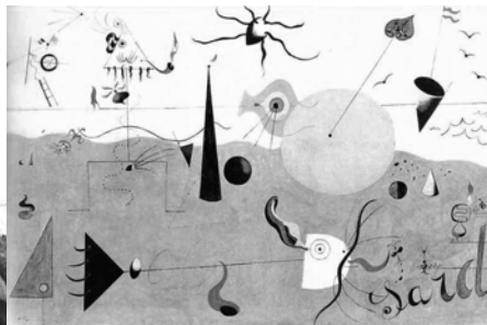
Miro's Catalan Landscape