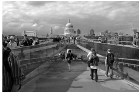
London's Millennium Bridge

Hosted by BU London, the students stayed at Crofton House, one of the university's newly acquired residences in South Kensington. Sitting in the shadows of Royal Albert Hall, Crofton was only a short walk away from BU London's main office building, where classes were held each morning. Each class focused on a different topic and featured a notable guest lecturer, who had either held high positions in culture for both government and private organizations or were a professor of arts administration and cultural policy from one of these London universities. Among