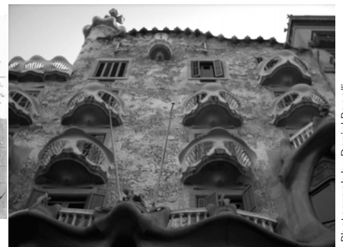
Gaudi Casa Batllo