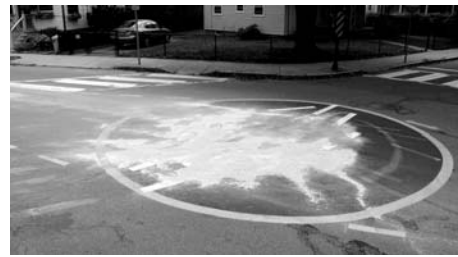
"Flow" following vandalism