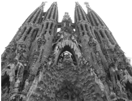
Gaudi Sagrada Familia